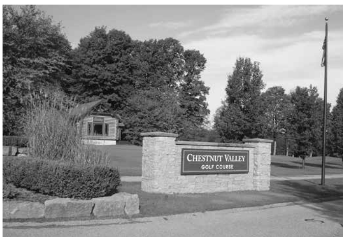
Chestnut Valley Golf Course, Boyne Highlands, Michigan

Ten teams, shown below (players not necessarily listed in order) golfed at the Chestnut Valley Golf Course, Boyne Highlands, Michigan, the day before the conference.