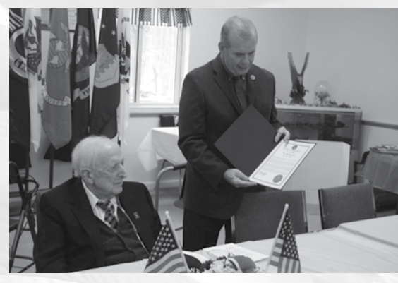
U.S. Rep. Tim Walberg, R-Tipton, also presented a special congressional tribute.